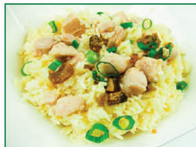
鹹魚雞粒炒飯 Salted Fish & Chicken Fried Rice $7.95