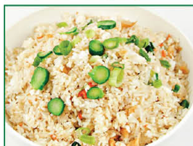
客家炒飯 Hakka Vegetable Fried Rice $7.95