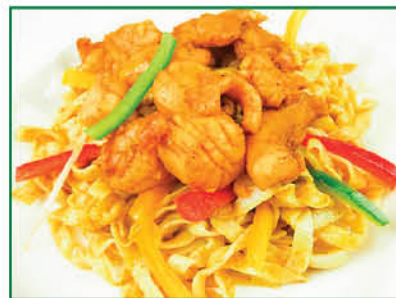
星洲海鮮炒河 Singapore Seafood Fried Flat Rice Noodle $7.95