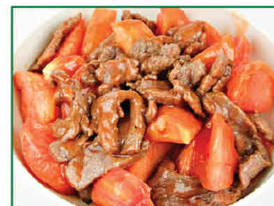
蕃茄牛肉 ★ Tomato Beef $7.95