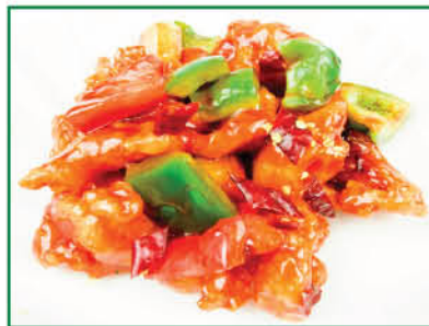
左宗雞 ★ General Tso's Chicken $7.95