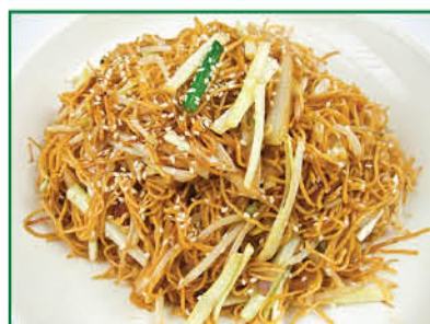
豉油皇炒麵 Soy Sauce Chow Mein $7.95