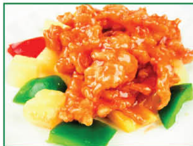
甜酸雞 ★ Sweet & Sour Chicken $7.95