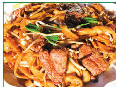
干炒牛河 Stir-Fried Beef Flat Rice Noodle $7.95