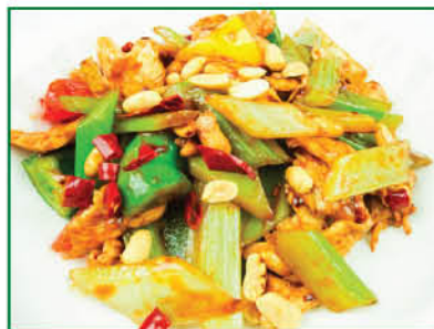
宮保雞 ★ Kung Pao Chicken $7.95