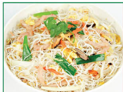
台式炒米粉 Taiwan Style Stir-Fried Rice Noodle $7.95

From 11am to 3pm Daily (★ with Steamed Rice)