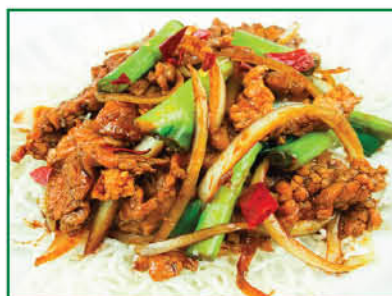
蒙古牛 ★ Mongolian Beef $7.95