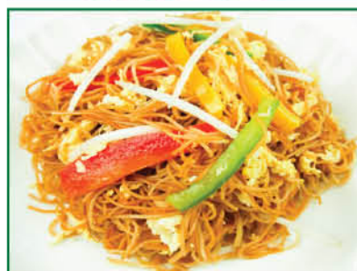
獨家炒粉絲 Special Vermicelli Noodle $7.95