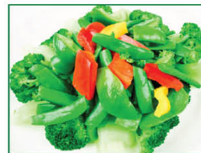
炒青菜 ★ Stir-Fried Fresh Vegetables $7.95