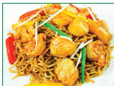
大三元拉麵 Triple Crown Hand-Pulled Noodle $7.95