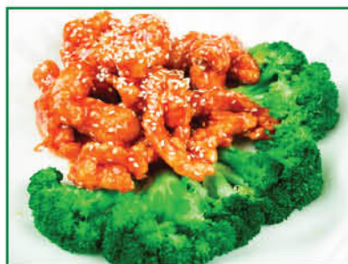
芝麻雞 ★ Sesame Chicken $7.95