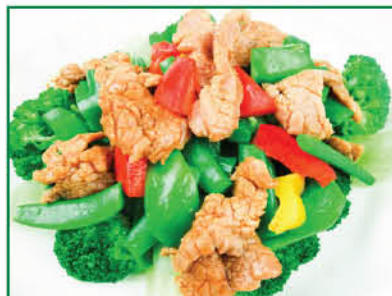
青菜牛肉 ★ Beef with Vegetables $7.95